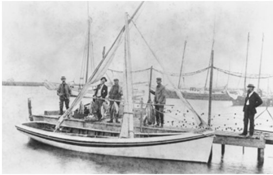
Fishermen at Manteo pose with their catch behind a Roanoke Island shad boat, ca. 1900.

See also: North Carolina State Symbols and Official Adoptions main page [2]