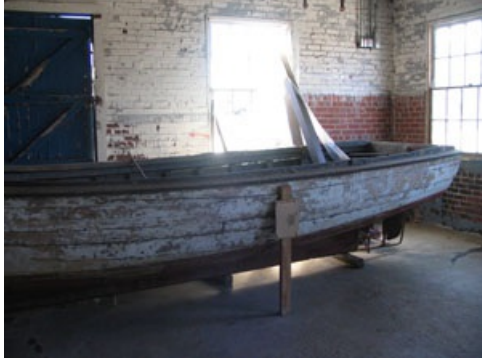
Photograph of a shad boat, Roanoke River Lighthouse and Maritime Museum, Plymouth, N.C., April 5, 2006.

The keel was a hewn white cedar trunk, and the curved frames were cut from buttress roots. The hand-shaped keel log reflects descent from the split-log dugouts (periaugers) that utilized a similar centerpiece. Early shad boats had round