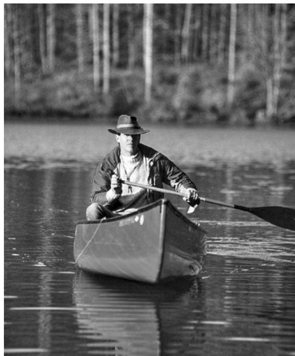
Canoeing at Umstead State Park near Raleigh.

Between the years 1934 to 1941, North Carolina's early parks experienced a period of rapid development through Depression [10] -era New Deal [11] programs such as the Civilian Conservation Corps [12] and the Works Progress Administration [13] . Following the end of World War II [14] , high public demand for recreation facilities spurred continued growth of the state parks system and the expansion of the Branch of State Parks into a separate Division of State Parks in 1948. Since 1969, the state parks system has mushroomed in size thanks to the easing of former legislative restrictions on acquiring land for new state parks.