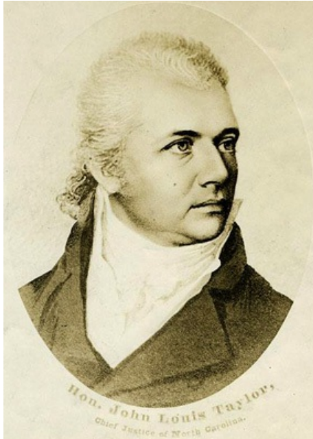
John Louis Taylor, first Chief Justice of the Supreme Court of North Carolina, 1819-1829.

See also: Judicial Branch [2] ; Roster of North Carolina's State Supreme Court Justices [3]