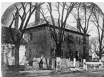
New Bern Jail, Craven St., New Bern, NC, c.1864.

Queen Anne did in fact see her country as the protector of European Protestantism and looked favorably upon the idea of providing aid to the impoverished German emigrants, many, though not all, of whom were Protestants. Her intent coincided with the need of the Proprietors [12] of Carolina and Pennsylvania for settlers. By 1709, as suffering increased in Germany, 1,000 refugees a week began making their way up the Rhine River and over to England. Within a short time, London was crowded with homeless refugees who lived in tents along the banks of the Thames River [13] . Colonization was seen as one solution to the problem.