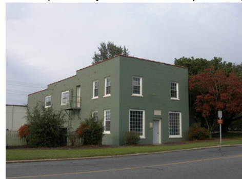
Municipal Milk Plant Tarboro, North Carolina Constructed in 1924 and operated until the 1950s. This was the first city owned milk plant in the USA, 2010.

The Tarboro Municipal Milk Plant [2] was established in 1918 in response to [3] a severe outbreak of typhoid fever, dysentery, and colitis that claimed the lives of several Tarboro children and left many of all ages weak and ill. That year the town (population 6,400) had obtained its entire milk supply raw and untreated from surrounding farms. There were no large commercial dairies with refrigerated delivery anywhere nearby. Epidemics had been traced to untreated "farm milk" before, but the outbreak in 1918 was severe enough to stir the citizens to drastic action. An ordinance was passed by the town council prohibiting any