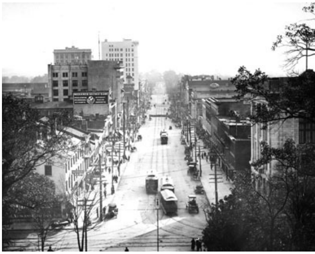
Elevated view of Fayetteville Street, Raleigh, NC, looking south showing the main business district, 1913.

[11] Townships were convenient administrative subdivisions, particularly for the purpose of building and maintaining roads, although by the early twentieth century they were viewed as little more than "geographical expressions," stripped of all corporate powers. By that time most justices of the peace were appointed, either by the legislature or the governor, and their judicial powers were limited to misdemeanor criminal cases and civil cases involving no more than $50. It seemed that the bold township experiment of 1868 had run its course.