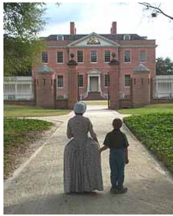
Tryon Palace, Restored 1959. Image courtesy of NC Highway Historical Marker C-2, North Carolina State office of Archives

attempt to balance the state budget.& History.