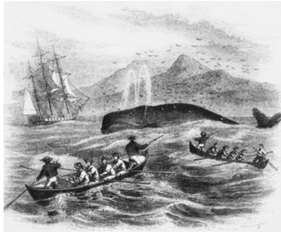
An 1856 engraving from Harper's Monthly showing small whaling boats similar to those launched by crews off the Outer Banks in the nineteenth century.