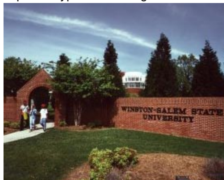
Winston Salem State University.

In 1925 the General Assembly recognized the school's leadership in the field of elementary teacher training by granting it a new charter, extending its curriculum above normal school level, and changing its name to Winston-Salem Teachers College. The school thus became the first African American institution in the nation to grant degrees for teaching in the elementary grades. In 1953 a nursing school was established at the college, awarding graduates the degree of bachelor of science. The state legislature once again revised the college's charter in 1957 by authorizing expansion of the curriculum to include secondary education and any other specific types of training as directed and determined by the State