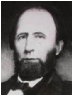
"Gov. William Holden."