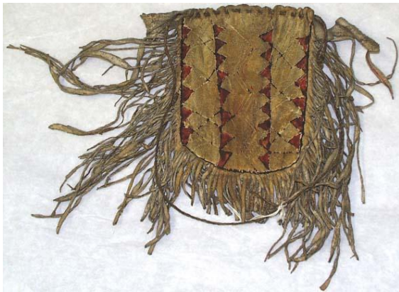
Cherokee medicine pouch circa 1700-1850, NC Museum of History

[9] Smallpox and other diseases brought by Europeans and enslaved Africans were more devastating to the Cherokee and other southeastern Indians than war. Since the Indians did not have the immune system the Europeans had built up after centuries of contact with these diseases, simple contact could set off an epidemic. Cherokee people were exposed to smallpox for a period spanning over three centuries. Probably their first exposure was in 1698, when a smallpox epidemic [10] decreased their population measurably. In 1738-39 the tribe experienced its worst epidemic from smallpox, when the disease was brought by traders or was brought back from an expedition in which the Cherokee aided the British against the Spanish in Florida. Between 7,000 and 10,000 Cherokees died, representing about one-half of the tribe's population. Since medicine men were unable to provide a cure, the Cherokee tried a traditional method of purification—sweat houses followed by plunging into icy streams. This practice only added to the number who died. Others who survived the disease were horror stricken by their disfigurement and killed themselves rather than live in disgrace.