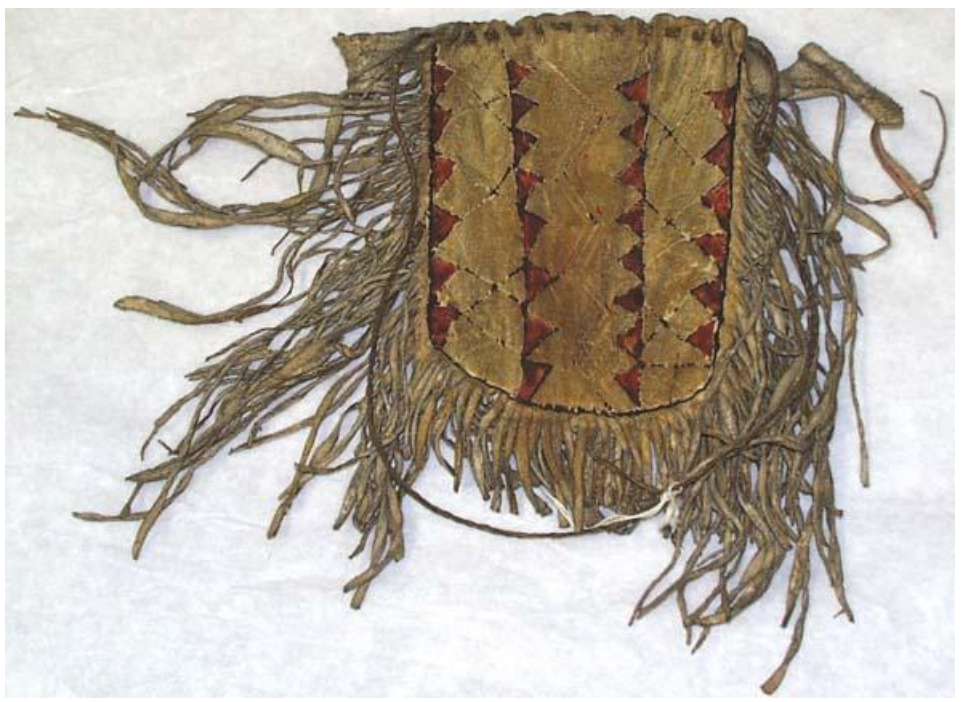
Part iii: Disease, Destruction, and the Loss of Cherokee Land

Cherokee medicine pouch circa 1700-1850, NC Museum of History [9] Smallpox and other diseases brought by Europeans and enslaved Africans were more devastating to the Cherokee and other southeastern Indians than war. Since the Indians did not have the immune system the Europeans had built up after centuries of contact with these diseases, simple contact could set off an epidemic. Cherokee people were exposed to smallpox for a period spanning over three centuries. Probably their first exposure was in 1698, when a smallpox epidemic [10] decreased their population measurably. In 1738-39 the tribe experienced its worst epidemic from smallpox, when the disease was brought by traders or was brought back from an expedition in which the Cherokee aided the British against the Spanish in Florida. Between 7,000 and 10,000 Cherokees died, representing about one-half of the tribe's population. Since medicine men were unable to provide a cure, the Cherokee tried a traditional method of purification—sweat houses followed by plunging into icy streams. This practice only added to