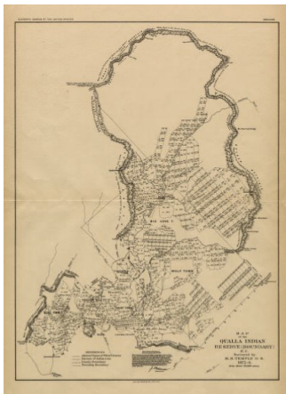
1890 Census map of the Qualla Boundary from the NC Maps collection.

[15] Approximately 300 to 400 Cherokees remained in North Carolina, hiding in the mountains. One of their leaders, Tsali [16] , was captured and executed for killing two federal soldiers pursuing him and his family, but some of his followers and other Cherokees (who had possibly aided in Tsali's capture) were allowed to remain. Between removal of the Cherokee Nation in 1838 and the end of the Civil War, many Cherokees gave their money to William Holland Thomas [17] , their agent and later their only white chief, to purchase land for them. Thomas acquired many of the tracts that would make up the modern-day Qualla Boundary [18] , the official name of the Cherokee Indian Reservation in North Carolina. These Cherokees—together with the hundreds who had hidden in the mountains, who already legally owned land through the Treaty of 1817, or who had escaped the Trail of Tears and returned—formed the nucleus of what would become the Eastern Band of Cherokee Indians.