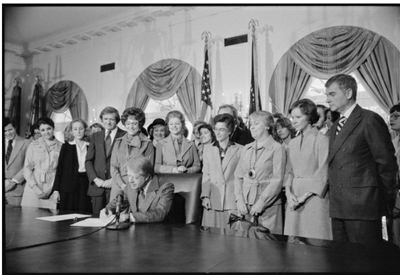
"Photograph of Jimmy Carter Signing Extension of Equal Rights Amendment (ERA) Ratification, Photo taken October 20, 1978. Women's Opportunities and Public Influence

Part 1: Introduction [7] ; Part 2: Women's Roles in Precolonial and Colonial North Carolina [8] ; Part 3: Women in the Revolutionary Era and Early Statehood [9] ; Part 4: Life in Antebellum North Carolina [10] ; Part 5: Secession and Civil War [11] ; Part 6: Women Help Shape the New South [12] ; Part 7: Women Earn the Right to Vote [13] ; Part 8: Activism and the Expansion of Women's Opportunities and Public Influence ; Part 9: References [14]