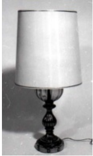
Electric lamp, 1973. Broyhill Furniture Industries [7]