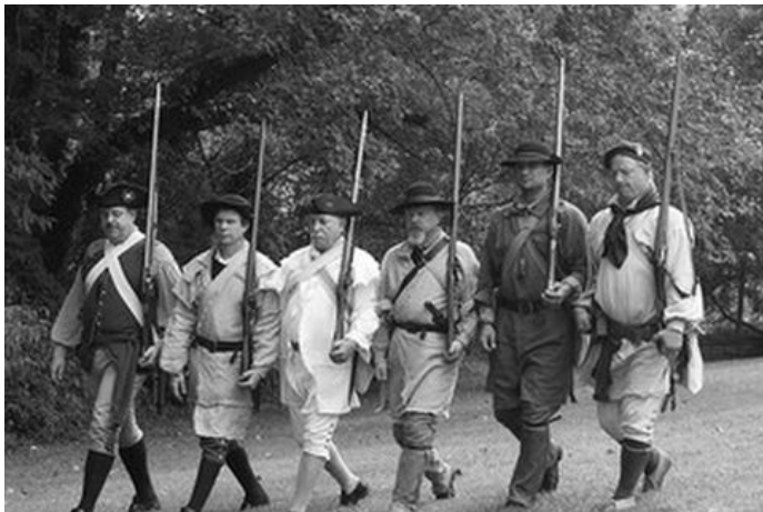
"Short Visit to the American Revolution 23."

A month before the "shot heard 'round the world," North Carolina's royal governor Josiah Martin [16] had asked for weapons from Gen. Thomas Gage in Massachusetts, but his letter was intercepted by the Whigs, or Patriots, as the radicals were now called. On 31 May 1775 the Mecklenburg County [17] Committee of Safety issued the Mecklenburg Resolves, which asserted that all laws and commissions issued by the British Crown were null and void and that the people should establish their own government and military forces. That same day, Martin sent his children and pregnant wife to New York for protection. During the night of 31 May 1775, Martin left New Bern for the safety of Fort Johnston [18] . The fort was not safe enough, however, and the Patriots began making moves to capture Martin, who barely escaped to a British warship. Three days later, on 18 July 1775, John Ashe [19] and Cornelius Harnett [20] led 500 militia in burning down Fort Johnston. The destruction of the British fort was the first act of war in the North Carolina colony.