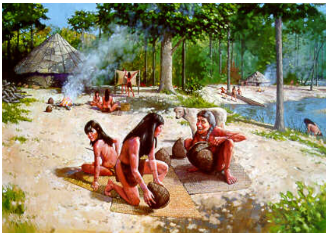
"Pottery making in North Carolina." Southeast Archeological Center, National Park Service.

[7] The history of American Indians before European contact is broadly divided into three major periods: the Paleo-Indian period [8] , the Archaic period [9] (8000–1000 b.c.), and the Woodland period [10] (1000 b.c.–1600 a.d.). The limited evidence available about the Paleo-Indian period suggests that the first Indians in the Southeast, as elsewhere, were nomadic, hunting and defending themselves with stone tools (knives and scrapers), clubs, and spears, which were at times tipped with wellcrafted, fluted stone points. During the Archaic period, basketry, bone tools, and finer stone tools appeared. Archaic peoples also began to develop more specialized knowledge of their local environments and the animals and plants that lived there. Though they did not generally travel far beyond these familiar environments, American Indians during this period did begin to establish trade and migration routes that brought the native peoples of the Carolinas in contact with other bands and tribes.