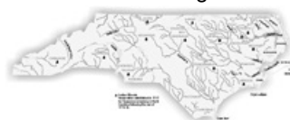
Principal American Indian tribes at the time of the Tuscarora War. (Tribes largely displaced by European settlement shown in parentheses.)

At the same time that European settlement brought violent conflict between whites and Indians, it also increased the occurrence of warfare between Indian tribes. There were several factors influencing these hostilities. Many historians have concluded that a central cause of the problem was trade between the natives and the newcomers. Initially, there is evidence to suggest that North Carolina’s native peoples worked and lived cooperatively with the Europeans, teaching them agricultural techniques for corn, tobacco, and other cultivation as well as fishing and other necessary survival skills. In return, the white settlers offered the Indians manufactured goods from their homeland. But this trade led to a massive upheaval in both the ways Indians related to each other and how they came to view the white settlers. The introduction of these items resulted in the Indians’ becoming increasingly reliant on products such as metal knives, hoes, and hatchets as well as guns and ammunition. The acceptance of these effective new tools and other trade products made them vulnerable to manipulation by white traders and colonial authorities, who often turned one native tribe against another for political, economic, or other purposes. Many unscrupulous white traders also charged unfairly high prices for their wares,