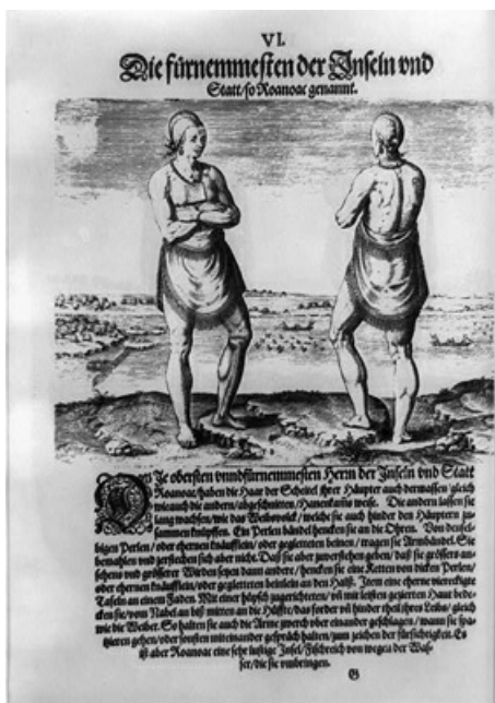
Bry, Theodor de. 1600. "A chief of Roanoke."

[8] Whether speaking in a historical context or of the present day, there are many ways to define an American Indian tribe. In its most widely understood form, however, an American Indian tribe is a group of bands, often (though not always) related by family ties, sharing common territories and having a feeling of unity deriving from similarities in culture, frequent friendly contacts, and other shared interests. More or less elaborate types of formal tribal organization may be defined within these basic outlines, but tribal groups can exist and function without them. One important way scholars have defined tribes for the purpose of study is by linguistic group. Many North Carolina tribes disappeared or merged with other groups before their languages were recorded, but word lists, town and tribal names, and other indicators suggest that by the sixteenth century, when European explorers first arrived in the region, native tribes populating North Carolina, both Mississippian and Woodland, comprised three linguistic groups: Iroquoian, Siouan, and Algonquian. The two most prominent Iroquoian tribes were the Cherokee [9] , occupying the Blue Ridge Mountains and regions west and south, and the Tuscarora [10] , occupying the Coastal Plain between Ocracoke Island and Topsail Island inland to the central Piedmont. The Neusioc and Coree, also Iroquoian, occupied the Cape Lookout environs of modern Carteret [11] and Craven [12] Counties.