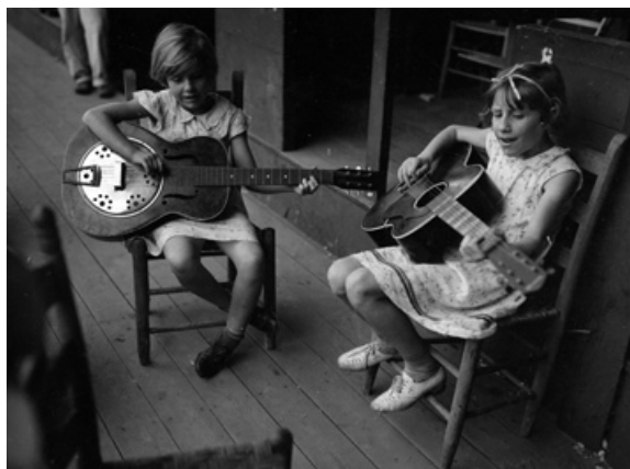
Mountain Music Festival, Asheville, NC, September 1938, photo taken by Baker. Conservation and Development Department, Travel and Tourism Division Photo Files, North

Folk Festivals - Part 1: Introduction [14] ; Folk Festivals - Part 2: Original Folk Festivals and Contemporary Gatherings [15] ; Folk Festivals - Part 3: Ethnic and Holiday Festivals [16] ; Folk Festivals - Part 4: Music and Food Festivals ; Folk Festivals - Part 5: References [17]