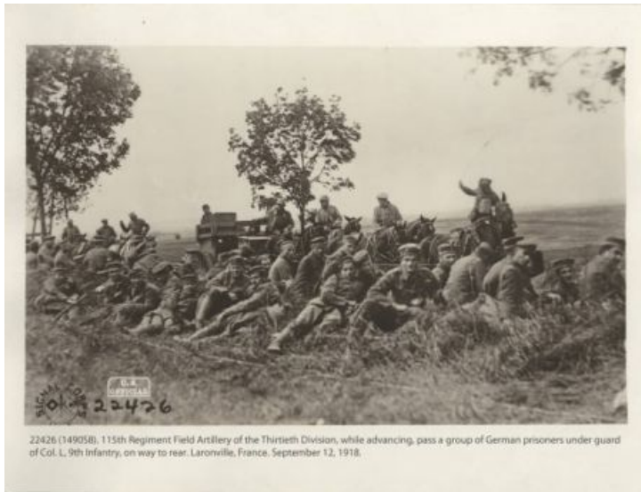
US Army, Signal Corps. 1918. "115th Regiment Field Artillery of the Thirtieth Division passing a group of German prisoners under guard of 9th Infantry, Laronville, France, September 12, 1918"

See also: World War I and the Technology and the Weapons of War [2]