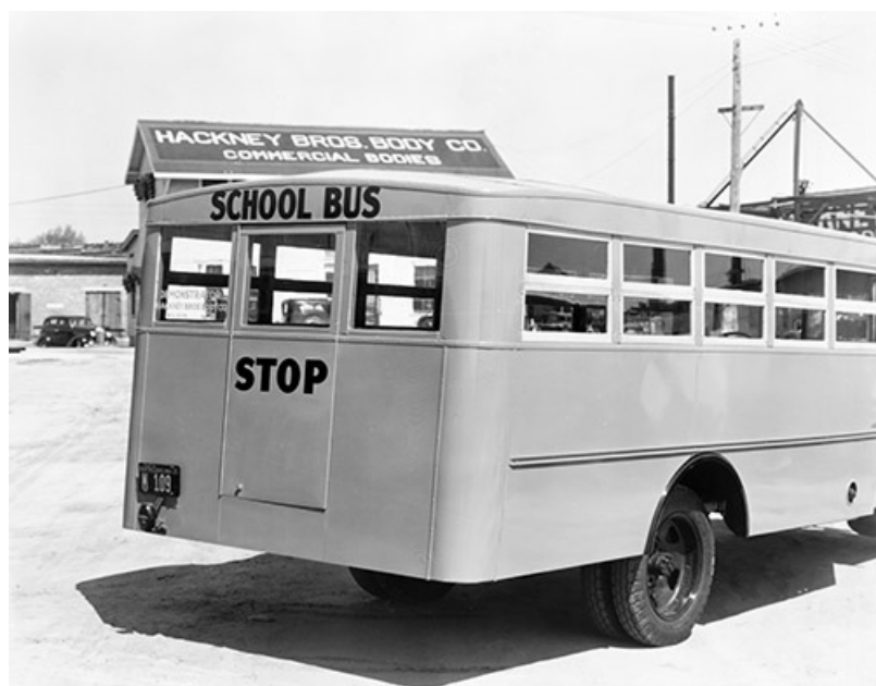
School Bus, 1936.

In reality, and despite occasional legislative initiatives and the continued efforts of various Black advocacy groups and philanthropic organizations, the public education of the state's Black children under Jim Crow [32] remained strikingly inferior to that of white children. The separate-but-equal doctrine adopted by the state in 1875 and subsequent Jim Crow statutes passed in the early 1900s solidified the second-class status of publicly supported Black schools. For example, the 1903 law clarifying that no North Carolina child with "Negro blood in its veins, however remote the strain, shall attend a school for the white race, and no such child shall be considered a white child" displays this difference in educational priority.