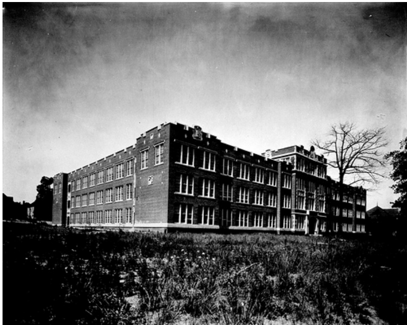
Exterior of Hugh Morson High School, Raleigh, NC, no date (c.1930-1940s).