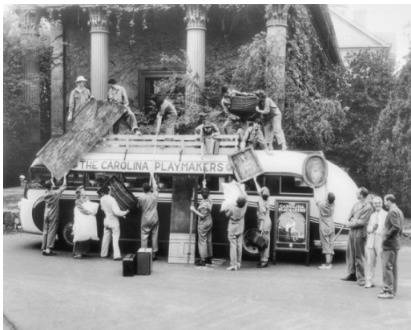
Members of the Carolina Playmakers load a bus with props before leaving on a tour in the fall of 1941. The company, based at the University of North Carolina in Chapel Hill, played an important role in the development of American folk drama and nurtured several generations of North Carolina theater artists.