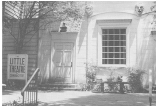
Little Theatre of Charlotte. Image available

Dramatic Arts- Part 4: Professional Companies and Festivals [8]