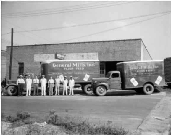
General Mills Trucks 1947

Rising worldwide lumber prices and environmental concerns spawned wood chip processing plants that made more efficient use of valuable forest resources. Hog and poultry [22] processing plants made North Carolina a major national supplier of hogs, chickens, and turkeys by 2000. Despite some economic struggles, the furniture industry was still strong, remaining the second-largest employer in the state, with approximately 70,000 workers.