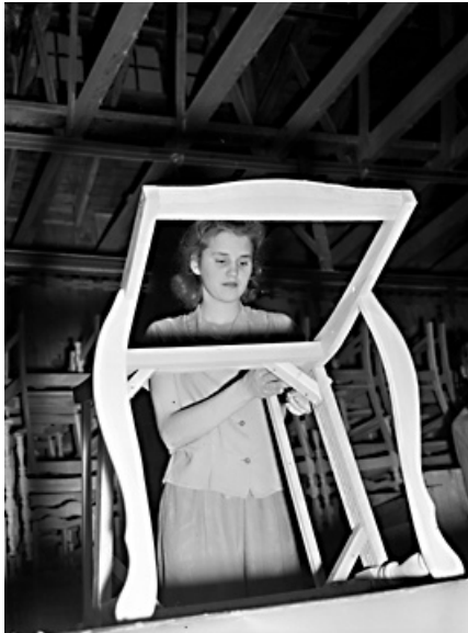
Lenoir Chair Company, Lenoir, NC (Caldwell County); final assembly and sanding, c.1943, [19]

The postwar era found North Carolina and other southern states ready to take on even more industrial development, as high wages, strong union influence, and declining protective tariffs reduced northern industries' ability to meet increasing foreign competition. Eventually, foreign competition would undercut even North Carolina's lower costs, but in the interim the state benefited as companies closed their plants in the North and moved them south. By 1976 nearly three-fourths of American textile [20] production was concentrated in the South. Tobacco [10] production also remained important through much of the early postwar period. By 1969 North Carolina was growing 51 percent of U.S. tobacco, and this gave the state a similar lead in tobacco manufacture. The state's furniture production [6] flourished as North Carolina surpassed New York as the national leader, producing about 20 percent of the nation's total furniture products.