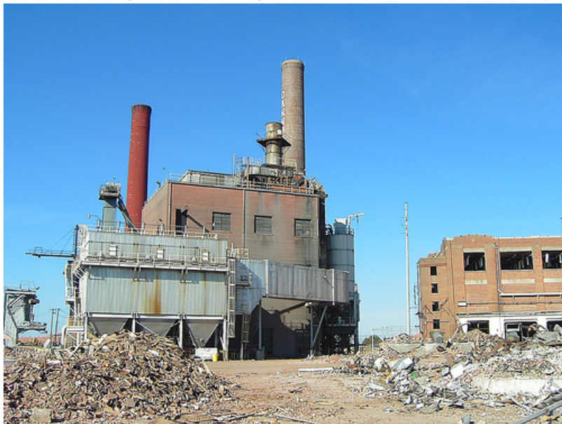
Demolition of Fieldcrest Cannon Mills, Kannapolis, NC, 2004.