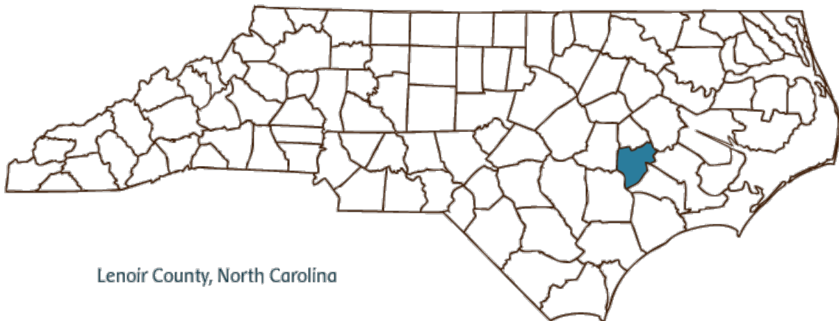
Lenoir County, North Carolina

NEIGHBORING COUNTIES: Craven [9] , Duplin [10] , Greene [11] , Jones [12] , Pitt [13] , Wayne [14]