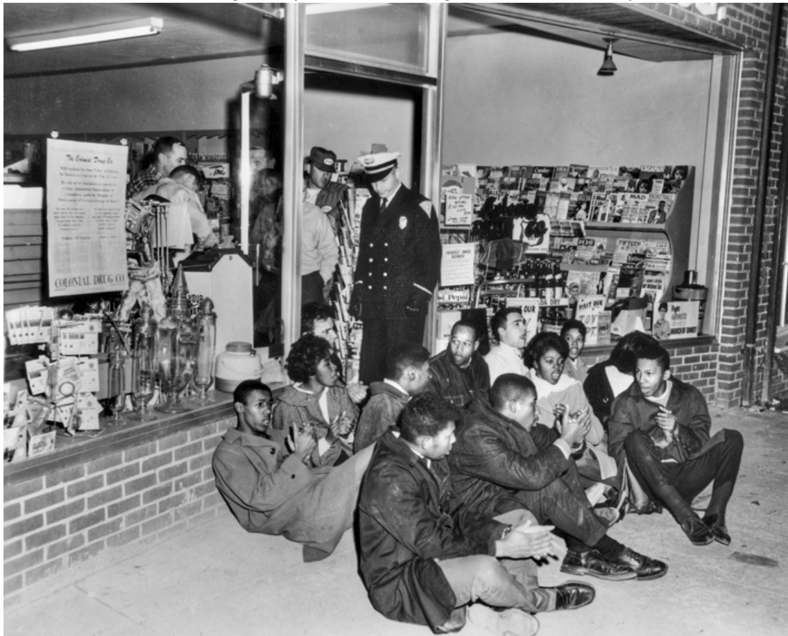
Demonstrators block the entrance to Colonial Drug Store in Chapel Hill in 1964 to protest its policy of serving whites only.

After the initial Greensboro sit-in [15] , other such protests followed around the state and the South: in the short term, a week later they spread to Durham [16] and Winston-Salem [17] and then to communities in South Carolina, Florida, Virginia, and Tennessee, while, in the long-term, they remained an effective tactic for many years. Charlotte [18] and Salisbury both saw successful sit-in movements, and in 1964 sit-ins came to Brady's Restaurant and the Colonial Drug Store, two popular eateries in Chapel Hill. These events heralded the collective entrance of young people into the civil rights movement as high school and college students participated en masse in sit-ins around the country. Organizations such as CORE [19] held workshops for sit-in planners, and protesters always adhered to certain guidelines. For example, they faced straight ahead at the counter, dressed well, generally did not talk among themselves, and always remained calm and nonviolent.