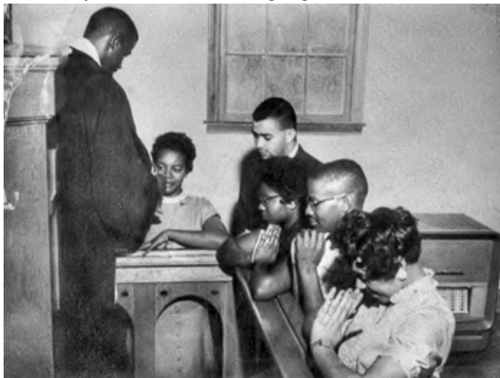
Durham pastor and civil rights leader Douglas E. Moore gives communion to five of the local youths who sat-in at the Royal Ice Cream Company shop in 1957.

Civil rights activists fought racism in their communities by standing up for themselves and using all the tools and tactics of the national civil rights movement; civil disobedience, strikes, picket lines, and economic boycotts (methods also utilized by the labor movement) were hallmarks of the 1950s and 1960s. The use of nonviolent protests in such forms as marches and sit-ins led to important progress in the integration of North Carolina's theaters, hotels, and restaurants by 1963. That year the General Assembly [12] voted to desegregate the National Guard [13] . Municipal cemeteries were eventually