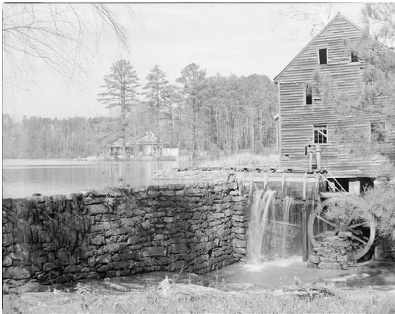
Piedmont mills harnessed water power, Yates Mill and pond, Raleigh, NC.

[31] With the exception of the great river systems of the Yadkin, the Catawba [32] , the Neuse [33] , the Cape Fear [34] , and the Roanoke [35] , the narrow, shallow, rocky streams and smaller rivers of the Piedmont provided ideal conduits to be harnessed for water power for grist mills, textile mills [36] , and electricity. Today, hydroelectric and steam generating plants dot the Piedmont landscape, creating great impoundments at Lake Gaston and Kerr Reservoir on the Roanoke River [35] , Jordan Lake on the Haw River, Lake Hickory and Lake Norman on the Catawba River [32] , and Badin Lake and High Rock Lake on the Yadkin River.