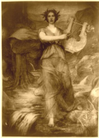
Mural, Lyric Poetry (detail)