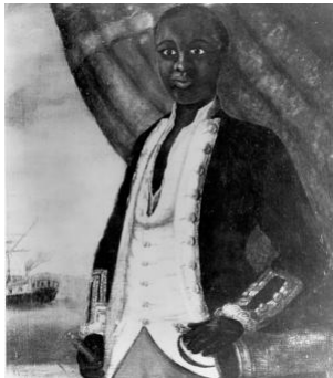
Black sailor during the US Revolution. Portrait by unknown artist, c. 1780. Original in the Newport Historical Society.

Two months later, on April 12, 1776, the Fourth Provincial Congress passed the Halifax Resolves [12] , officially endorsing independence from Great Britain. North Carolina representatives presented the resolves to the Continental Congress on May 27, the same day that Virginia offered a similar resolution. Within two months, representatives of the Continental Congress, including North Carolinians Joseph Hewes, William Hooper [13] , and John Penn [14] , signed the Declaration of Independence. In November, the Fifth Provincial Congress approved North Carolina's first state constitution and appointed Richard Caswell governor.