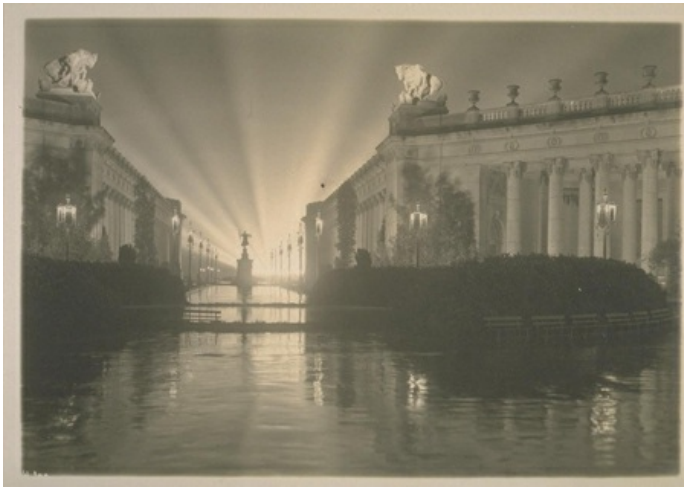
Court of Four Seasons, Henry Bacon-architect, illuminated by scintillator.

[25] Throughout his life, Bacon maintained close contact with family and friends in Wilmington [5]. In 1923 he spent Christmas with his family there and then returned to New York, where, in February, he entered the hospital for an intestinal cancer operation and died a few days later.