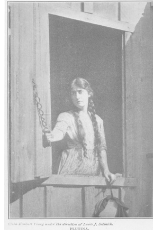
Image from Heart of the Blue Ridge (1915) motion picture.