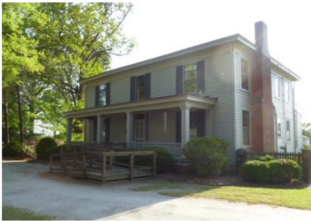
Joshua Barnes house, Wilson, NC.

[11] Assembly ratified on 15 Feb. 1855; it embraced portions of the counties of Edgecombe, Nash [12] , Johnston [13] , and Wayne [14] . He also served as chairman of the first session of the Wilson County court, held on 1 June 1857.