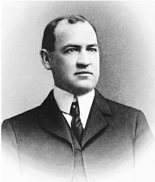
A 1905 engraving of James Craig Braswell.