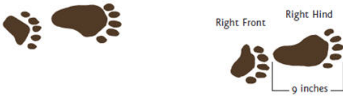
Black bear tracks