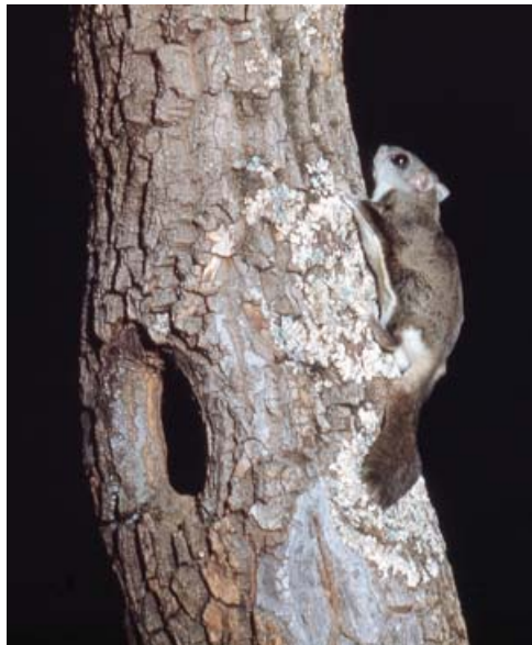
Flying squirrels live in trees with hollow areas

Southern flying squirrels live in hardwood and mixed pine-hardwood forests. They require older trees with cavities for roosting and nesting, and in winter readily roost together in surprisingly large numbers. Tree cavities have been found with as many as 50 roosting squirrels. Because of their need for tree cavities for habitat, they are a natural competitor for woodpecker's homes. Flying squirrels prefer cavities with entrances from 1 1/2 to 2 in. in diameter but will also customize holes to fit. In Sandhills longleaf pine forests, where suppression of natural periodic fires has allowed scrub oaks to grow in dense thickets, southern flying squirrels have been known to occupy the pine cavities of the endangered red-cockaded woodpecker.