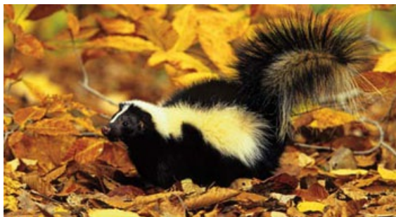
Striped skunk Order: Carnivora