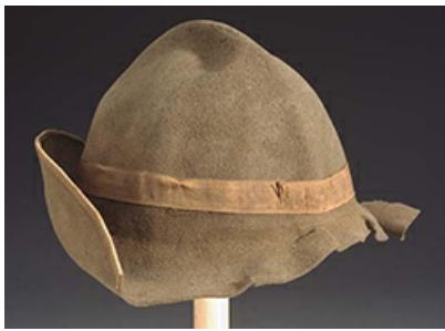
Thomas Lanier Clingman's hat, the brim sheared off by a shell at the Battle of Cold Harbor, 1864.

[12] Increased agitation over the slavery issue and the question of southern rights, precipitated by the Mexican War [13] , led Clingman to break with the Northern-dominated Whig party after his reelection to Congress in 1847. Though nominally a Whig until 1852, he drifted gradually toward the Democratic party and its representation of southern interests. Preferring to chart his own course, however, he never became an adherent of John C. Calhoun's effort to form a sectional party in Congress. Clingman opposed the Compromise of 1850, voting only for the Fugitive Slave Law. In 1852, along with thirteen fellow southern Whigs, he withdrew from the Whig Caucus when it refused to support the addition to the Whig Platform of a southern endorsement accepting as final the compromise measures and the Fugitive Slave Law. By 1854, when he backed the passage of the Kansas-Nebraska Act, Clingman had moved definitely into the Democratic fold. He continued to represent what he regarded as the interests and constitutional rights of the South until his withdrawal from the Senate at the onset of the Civil War.