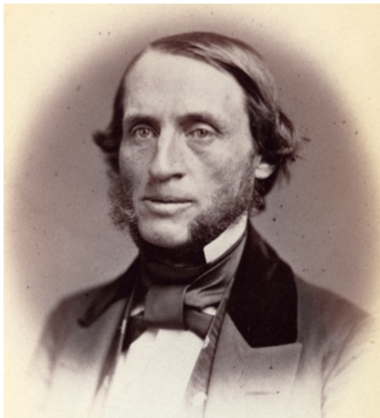
Photograph of Thomas Lanier Clingman, 1859.