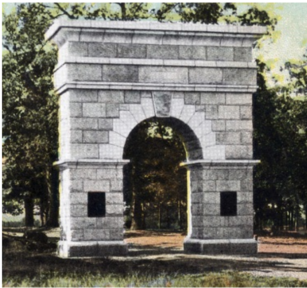
Photograph of the Davidson Arch at the Guilford Battle Ground.

[21] In the fall of 1777 he marched north with his regiment to join the army of General George Washington [22] . Whether these soldiers arrived in time to fight at Brandywine [23] is not clear, but Davidson was certainly present at the Battle of Germantown and was promoted to lieutenant colonel of the Fifth Regiment, traditionally for gallantry in action in that battle. Then followed the harrowing winter at Valley Forge. Along with his command, Davidson suffered the freezing weather, the inadequate supplies, and the shortage of food. There was some compensation for these trials in the excellent military training given at Valley Forge by Baron von Steuben. Among the friends acquired during this icy ordeal were "Light-Horse Harry" Lee and Daniel Morgan, both to aid later in the defense of the Carolina Piedmont.