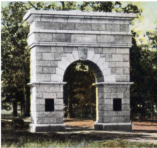
Photograph of the Davidson Arch at the Guilford Battle Ground. Image from the North Carolina Postcard Collection, Wilson Library, the University of North Carolina at Chapel Hill.

[21] In the fall of 1777 he marched north with his regiment to join the army of General George Washington [22] . Whether these soldiers arrived in time to fight at Brandywine [23] is not clear, but Davidson was certainly present at the Battle of Germantown and was promoted to lieutenant colonel of the Fifth Regiment, traditionally for gallantry in action in that battle. Then followed the harrowing winter at Valley Forge. Along with his command, Davidson suffered the freezing weather, the inadequate supplies, and the shortage of food. There was some compensation for these trials in the excellent military training given at Valley Forge by Baron von Steuben. Among the friends acquired during this icy ordeal were "Light-Horse Harry" Lee and Daniel Morgan, both to aid later in the defense of the Carolina Piedmont.