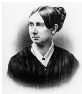
Dorothea L. Dix

Interest in the treatment of mental illness had been expressed in North Carolina in 1825 and 1838 but with no results. Several governors suggested care of people with mental illnesses to the General Assembly as a legislative priority, but no bill was passed. Then in the autumn of 1848 the champion of the cause of treatment of people with mental illness made North Carolina the focus of her efforts. Dorothea Lynde Dix [9] was a New Englander born in 1802. Shocked by what she saw [10] of the treatment of women with mental illnesses in Boston in 1841 she became a determined campaigner for reform and was instrumental in improving care for people with mental illnesses in state after state.