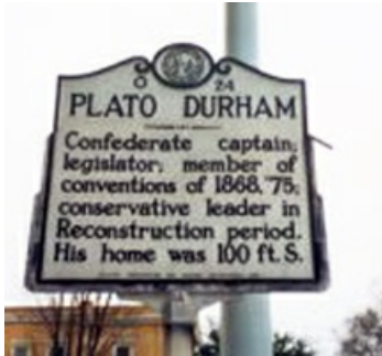
Photograph of Plato Durham Historical Marker in Shelby.