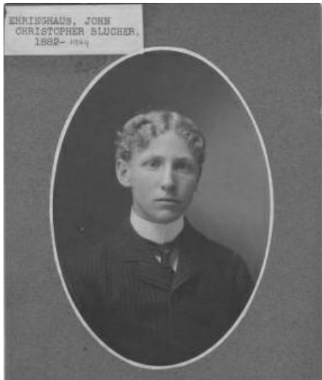
Portrait of John Christoph Blucher Ehringhaus.

[4] John Christoph Blucher Ehringhaus, legislator, solicitor of the First Judicial District, and governor of North Carolina during the early New Deal, was born in Elizabeth City, the son of Erskine and Catherine Colville Matthews Ehringhaus. His father was a leading merchant in Elizabeth City and later head of the bookkeeping department of First and Citizens National Bank. His mother died when he was ten years old. On both his mother's and his father's sides, the family dated back to important leaders in the Revolutionary War, though his Ehringhaus ancestors emigrated in 1812 from Germany to Elizabeth City where they became involved in banking.