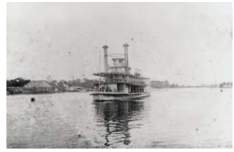
Cape Fear River Steamboat c. 1905

It wasn't until the mid-nineteenth century that the city of Wilmington really began to grow and thrive Navigational improvements were made to the Cape Fear River and the city's ports at the same time as the widespread adoption osteam-powered boats and trains [17]. The simultaneity of these events made the city an important point for global exports, including trade materials for ship building and agricultural products including cotton, rice, and peanuts. Also around this time the Wilmington & Weldon [18], Wilmington & Manchester, and Wilmington, Charlotte, and Rutherford Railroads established terminals in the town, which allowed trade to extend deep into Western North Carolina and beyond.