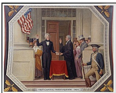
Allyn Cox's depiction of John Marshall administering an oath to Andrew Jackson. 1973 or 1974.

[19] Andrew Jackson may have been our seventh president, but he was first in many ways. He was the first populist president who did not come from the aristocracy, he was the first to have his vice-president resign ( John C. Calhoun [20] ), he was the first to marry a divorcee, he was the first to be nominated at a national convention (his second term), the first to use an informal "Kitchen Cabinet" of advisers, and the first president to use the " pocket veto [21] " to kill a congressional bill (legislation fails to become law if Congress adjourns and the president has not signed the bill in question).