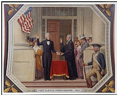
Allyn Cox's depiction of John Marshall administering an oath to Andrew Jackson. 1973 or 1974.

[19] Andrew Jackson may have been our seventh president, but he was first in many ways. He was the first populist president who did not come from the aristocracy, he was the first to have his vice-president resign ( John C. Calhoun [20] ), he was the first to marry a divorcee, he was the first to be nominated at a national convention (his second term), the first to use an informal "Kitchen Cabinet" of advisers, and the first president to use the " pocket veto [21] " to kill a congressional bill (legislation fails to become law if Congress adjourns and the president has not signed the bill in question).