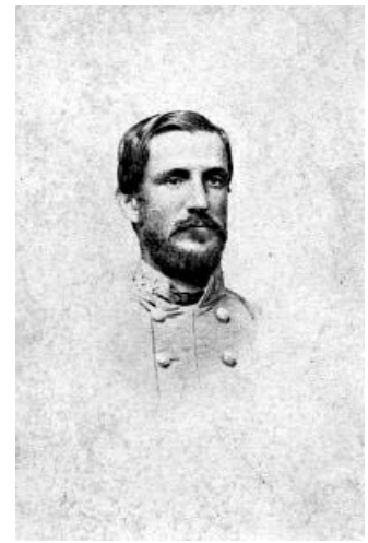
Photograph of Confederate Major General Robert Frederick Hoke. Image from the North Carolina Museum of

North Carolina. For his capture of Plymouth and its 3,000-man Union garrison, in which he History.