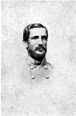
Photograph of Confederate Major General Robert Frederick Hoke. Image from the North Carolina Museum of History.

North Carolina. For his capture of Plymouth and its 3,000-man Union garrison, in which he was aided by the ram Albemarle [9] , Hoke was elevated to major general. The date of his commission and that of the battle, 20 Apr. 1864, were the same. General Robert E. Lee wrote President Jefferson Davis that he was pleased to learn of Hoke's promotion, "though sorry to lose him, unless he can be sent to me with a division."