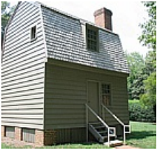
Andrew Johnson's birthplace, Raleigh,

Andrew Johnson began his life in a small wooden house, which is still preserved in Raleigh at the Mordecai Historic Park