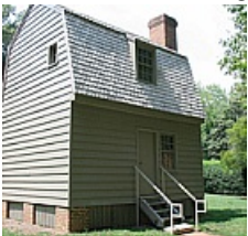
Andrew Johnson's birthplace, Raleigh,

Andrew Johnson began his life in a small wooden house, which is still preserved in Raleigh at the Mordecai Historic Park