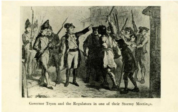
Image of engraving depicting "Governor Tryon and the Regulators in one of their stormy meetings." Item #H.1949.41.2, from the collections of the North Carolina Museum of History.

Petitions to the governor failed to bring relief. Although Regulators were elected to the Assembly [9] , they were unable to secure passage of desired legislation—in part, because members of the Assembly were beginning to support early steps that led to the American Revolution [10] . As a result the governor dissolved the legislature. The courts, it seemed, also failed the Regulators when the judges found Fanning guilty of charges of corruption but failed to punish him. When the Regulators broke up one session of court and threatened to repeat such action, the governor called out the militia to restore order in Orange County [4] and elsewhere in the backcountry.