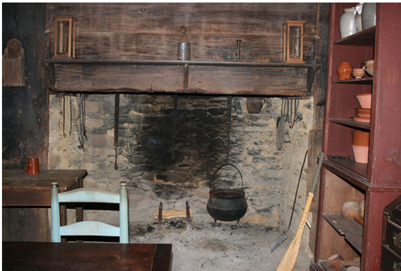
Kitchen at Allen House, Alamance County, N.C.

[3] Today's rapidly increasing demands and hectic schedules make it challenging for a family to dine together. Many dinners include fast food or carryout delivery from places like KFC or McDonald's. When families do have time to prepare a meal, it is rarely "from scratch." Technology that we often take for granted—such as microwaves and refrigerators—has greatly affected what we eat and how we eat it.