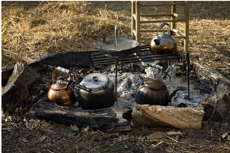
Battle of Bentonville reenactment. Civil War campfire.

Tar Heel Junior Historian Association, NC Museum of History